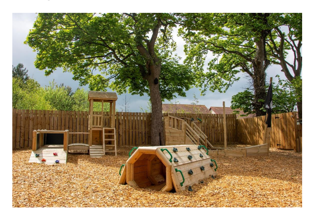
Early Learning and Childcare

At our sister nursery in Gorebridge, we run a pioneering Intergenerational Project with our local care home, for which we won an award at the Generations Working Together conference. We visit the care home every week with different age groups of children, and we also run a Pen Pal scheme between our Early Learners and the residents. Please have a look at our website or Facebook page for further details.